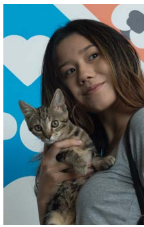
Big Adopt Out 2016 Saturday 17 January

Prisbane Showgrounds 236 animals adopted