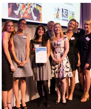
Left: People Services, Highly Commended Staff President's Award Right: Happy Paws, Happy Hearts, Winner of the Staff President's Award.