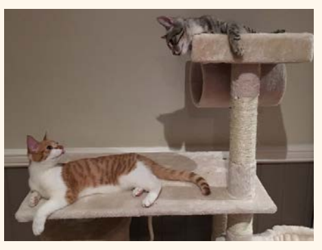
Emmett and Krispy

This is a story about two different tabby cats, Emmett and Krispy, who found friendship and a warm, loving home.