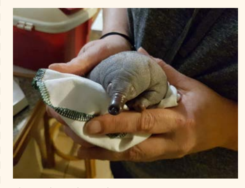
Above: Edwina, the Puggle

If you see an injured or sick animal in need of help call our 24/7 Animal Emergency Hotline 1300 ANIMAL (1300 264 625) for assistance.