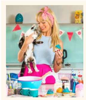
Cupcake Day 2016 Monday 15 August

$ $440,498.94 raised in QLD (Best results for CCD in QLD to date)